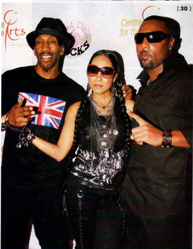
[ 30 ]