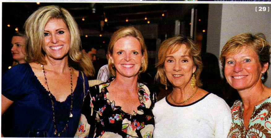
[ 29 ]