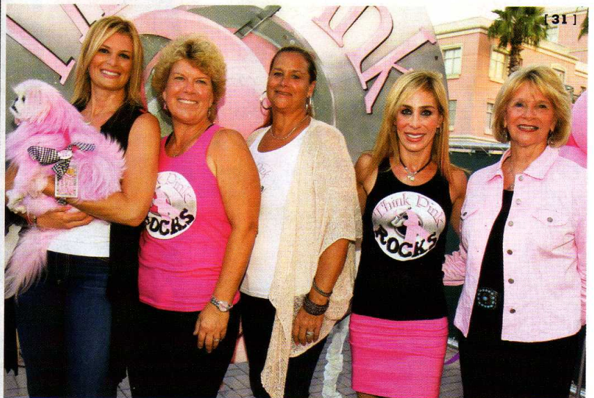
[ 31 ]